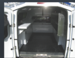
Versatile interior space.