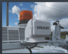
Go Light Searchlight