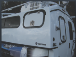
Fiber Optics doors.