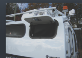
Side Access Doors.

FOR MORE INFORMATION VISIT; WWW.MORYDIRECT.COM