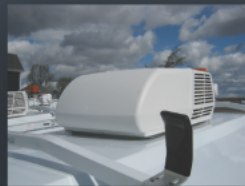
Heating / AC Unit